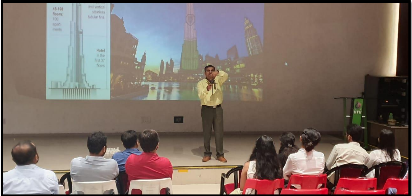
Demonstration based active learning & assessment