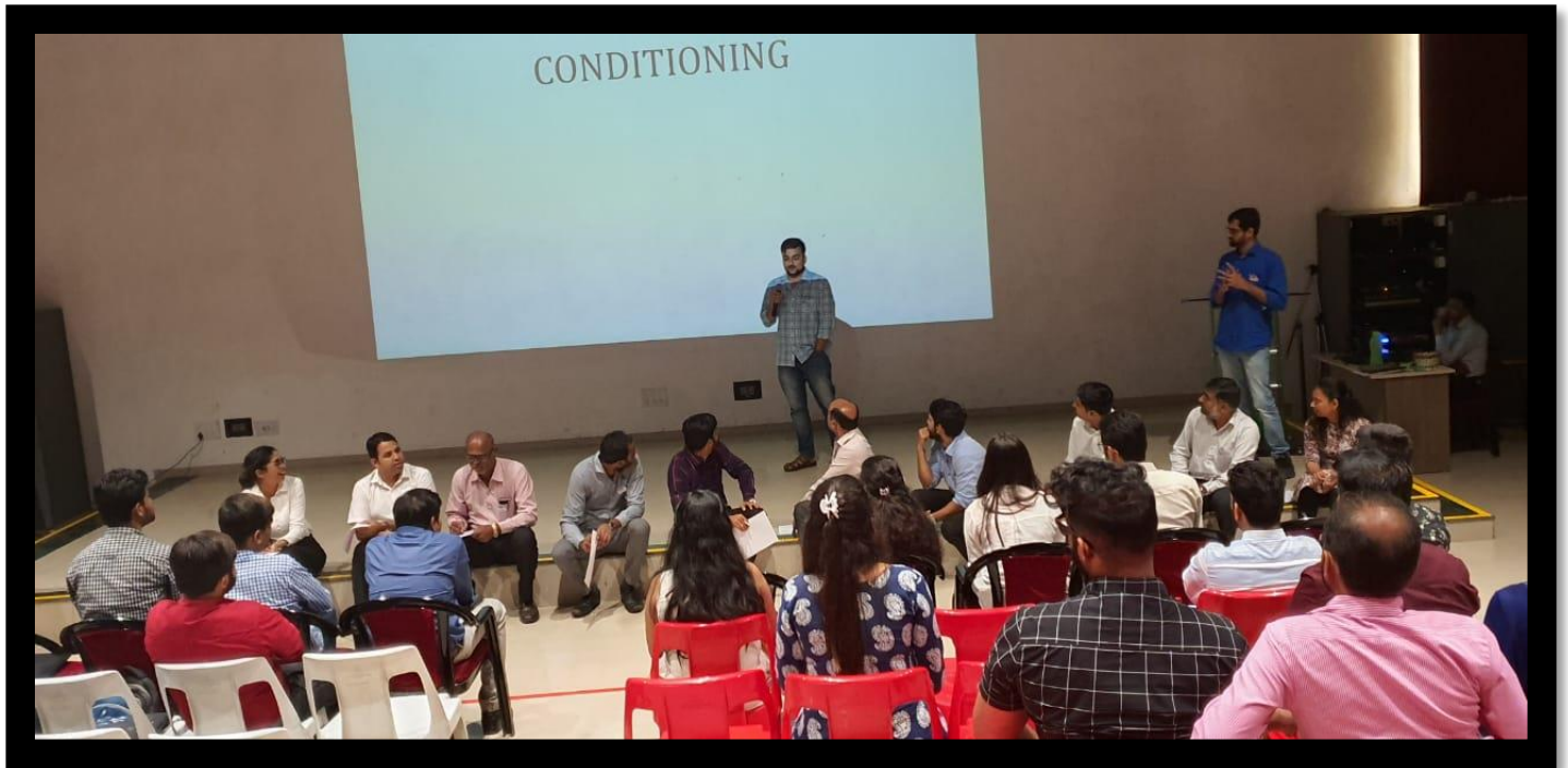
Demonstration based active learning & assessment