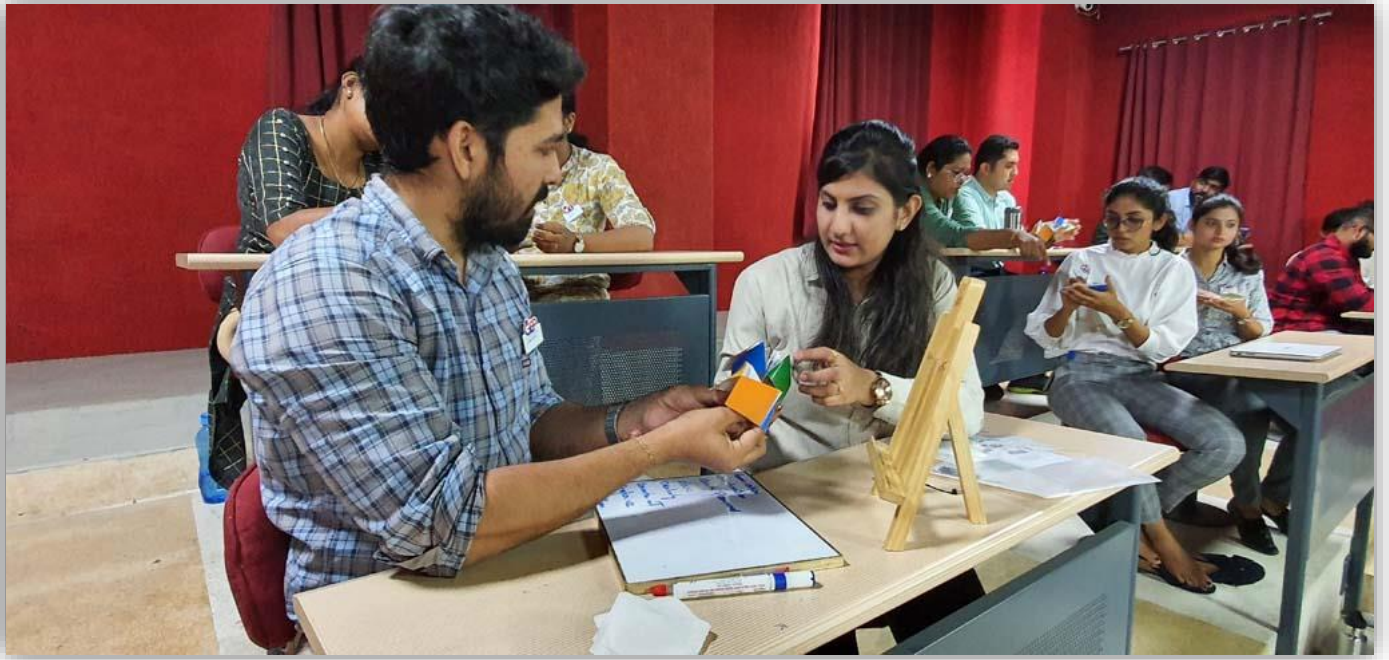
Collaborative learning activity