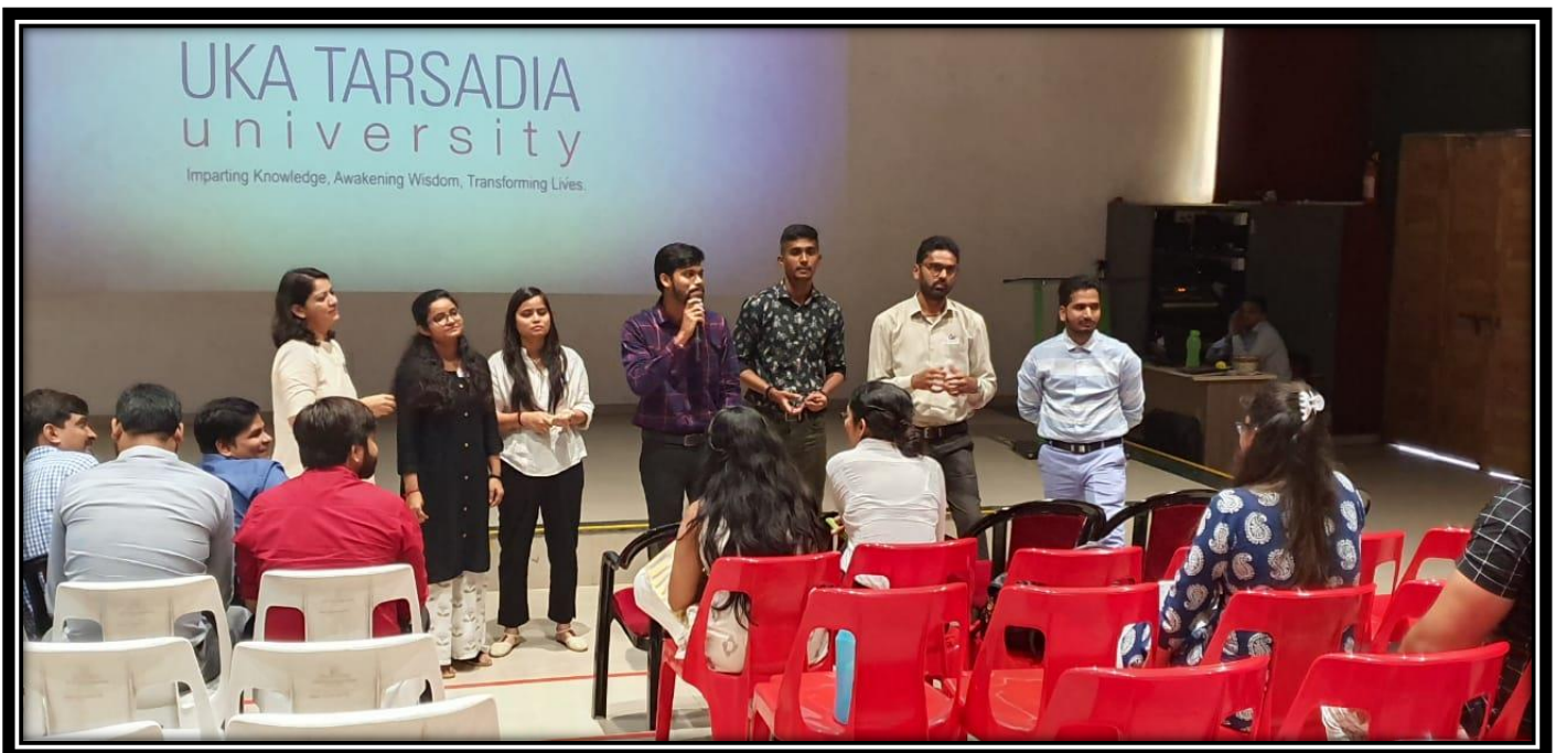
Demonstration based active learning & assessment