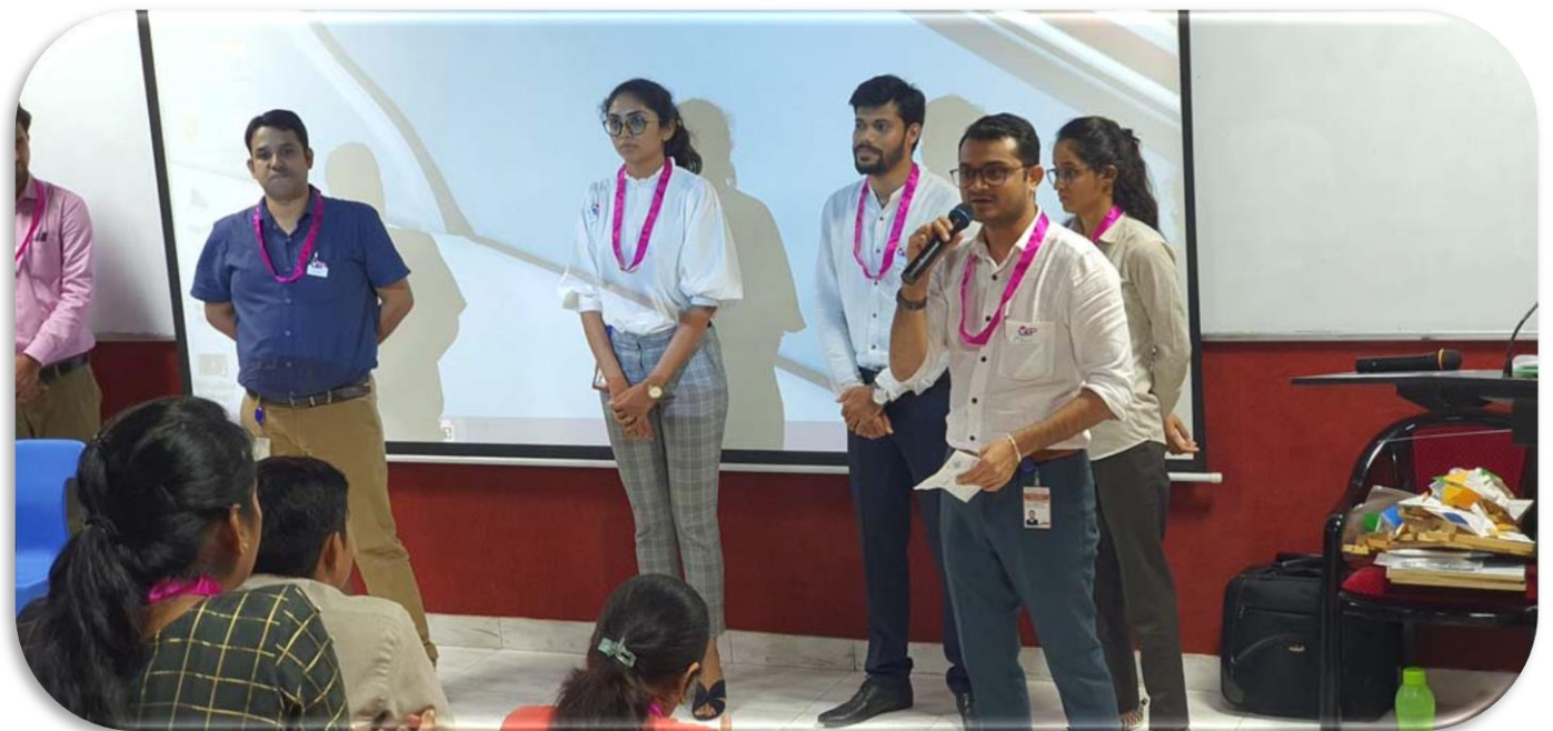
Critical thinking approach into teaching/learning