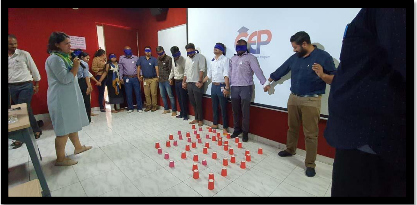
Problem based learning techniques applicable in 21 st century education